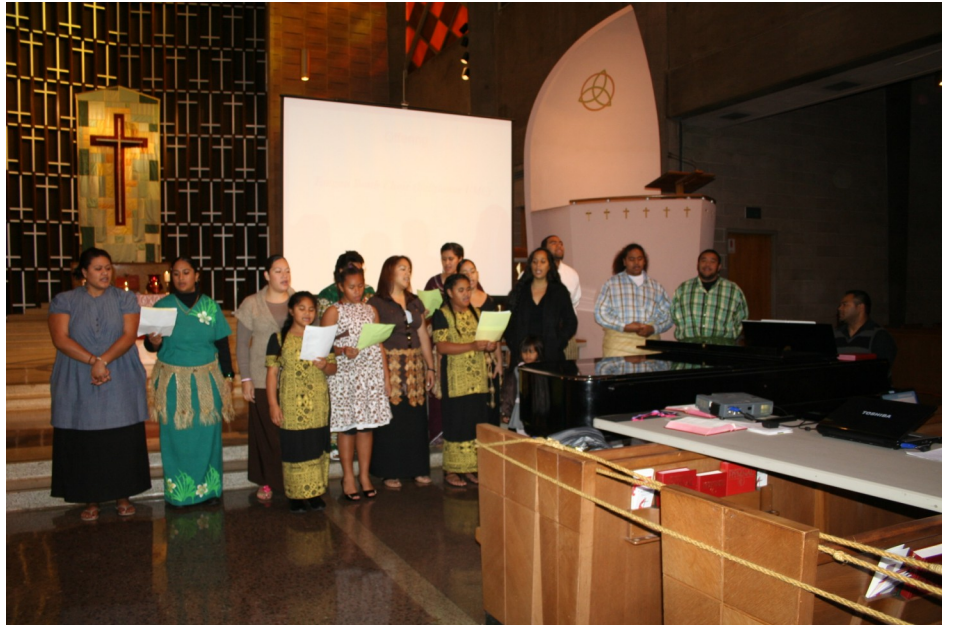
Tongan Youth Choir from Bellflower First United Methodist Church